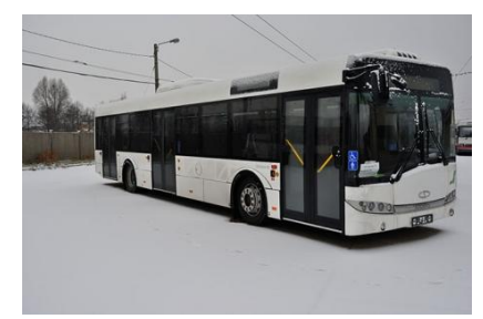
EEV solo bus Solaris