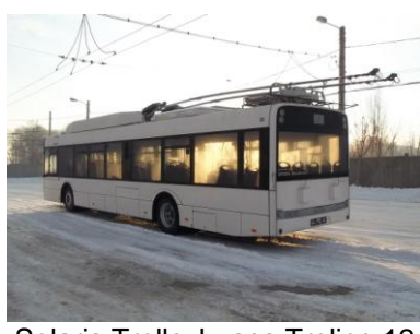
Solaris Trolleybuses Trolino 12